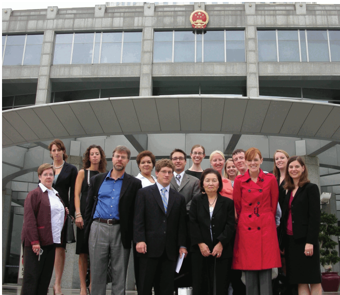
Policymakers trip participants pose in front of the Chinese Ministry of Foreign Affairs

On August 31, a delegation of 14 congressional staffers departed for a week-long trip to China. Highlights of the trip included meetings at the U.S. Embassy in Beijing, the Ministry of Foreign Affairs, the National People's Congress, Fudan University, and the Shanghai and Suzhou Municipal People's Congresses, as well as visits to the Shanghai Urban Planning Exhibition Museum and the Semiconductor Manufacturing International Corporation. Participants also toured historic landmarks such as the Forbidden City, the Great Wall, and the Yuyuan Gardens to expand their knowledge of Chinese history and culture. At the end of the trip, the members of the delegation wrote reports expressing their newfound knowledge of China. Through the trip and seminar series, the congressional staffers became better equipped to provide relevant and accurate information to members of Congress regarding policies relating to China. (August 31 - September 7, 2008)