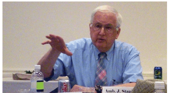
Amb. J. Stapleton Roy provides participants with a brief overview of U.S.-China relations. (August 8, 2008)

The Honorable J. Stapleton Roy, Director, Kissinger Institute on China and the United States, Woodrow Wilson International Center for Scholars; former U.S. Ambassador to Singapore, the People's Republic of China, and Indonesia