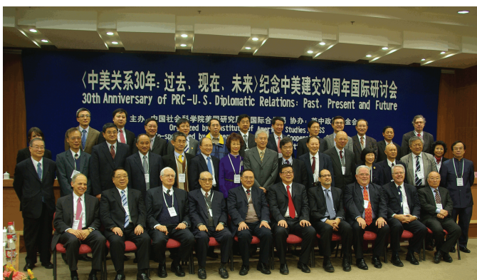
Conference participants pose for a photo at the Chinese Academy of Social Science.