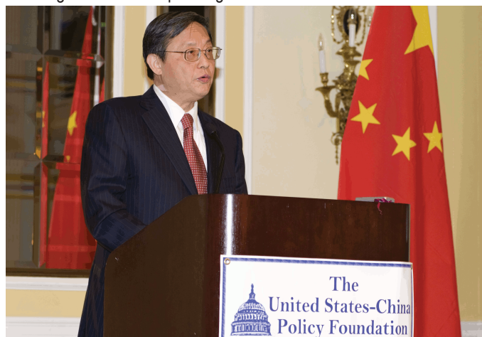
Ambassador Zhou delivers remarks at the USCPF's annual Gala Dinner.

His Excellency Zhou Wenzhong, Ambassador of the People's Republic of China, presided over the evening's events and delivered the dinner address. Amb. Zhou began by sharing a letter from Chinese President Hu Jintao to U.S. President-elect Barack Obama. President Hu conveyed his congratulations to the newly elected president and expressed his hope the United States and China would continue to work together to develop strong ties.