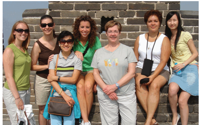
Trip Participants and hosts from the National People's Congress visit the Great Wall