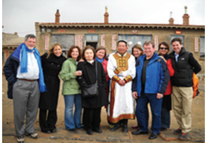
Policymakers meet with ethnic minorities in Inner Mongolia