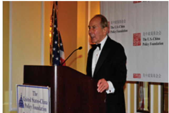
USCPF Honorary Chairman, Maurice R. Greenberg, shares his remarks as he accepts the Global Business Leadership Award.

American International Group's Chief Executive Officer by founder Cornelius Vander Starr, serving in that role from 1968 to 2005. During that time, he helped to establish AIG as a leading insurer around the globe in a variety of product areas. In addition to his responsibilities as CEO of AIG, Mr. Greenberg has had extensive involvement in policy areas, with a particular emphasis on East Asia. He is also the Honorary Chairman of the U.S.-China Policy Foundation.