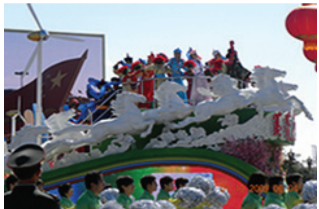
This float in the civilian parade held in Tiananmen Square on October 1, 2009, is representative of the jubilant spirit of the 60th anniversary festivities in Beijing.

Sixty years after Mao’s famous declaration on the Tiananmen rostrum, China has “stood up.” Although China must still face many challenges and address its weaknesses, we would like to celebrate the spirit of resilience that has carried China on its extraordinary journey since the founding of the People’s Republic of China. The U.S.-China Policy Foundation cherishes the fostering of U.S.-Sino relations that has occurred over the past 30 plus years and looks forward to continued collaboration with this remarkable country.