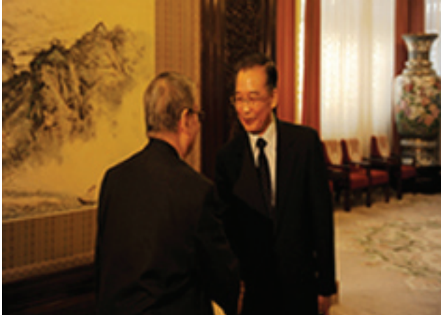
Premier Wen Jiabao meets USCPF President and Chair Chi Wang in the Purple Light Pavilion (Ziguangge) in the Zhongnanhai complex.

On January 12–13, 2009, the U.S.-China Policy Foundation (USCPF) participated in a two-day conference in Beijing to commemorate the 30th anniversary of the normalization of diplomatic relations between the China and the United States. This event, which was sponsored by the Chinese People's Institute of Foreign Affairs, the Kissinger Institute on China and the United States, and co-sponsored by the National Committee on U.S.-China Relations, was attended by senior government officials and scholars from both countries.