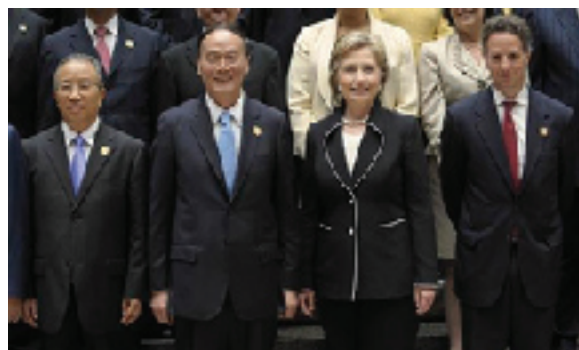
State Councilor Dai Bingguo, Vice Premier Wang Qishan, Secretary of State Hillary Clinton and Secretary of the Treasury Timothy Geithner pose before the dinner.

Organizations joining the USCPF as co-hosts for the event included: the US-China Business Council; the National Committee on U.S.-China Relations; the United States Chamber of Commerce; American-China Forum; the Brookings Institution; the Center for Strategic and International Studies; the Committee of 100; the Council on Foreign Relations; China Chamber of Commerce in the USA; China-U.S. Exchange Foundation; Hong Kong Phoenix Satellite Television; the Financial Services Forum; and the Peterson Institute for International Economics.