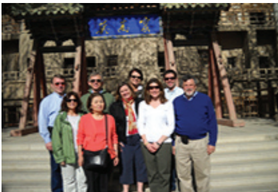
Policy makers visit Dunhuang in Gansu Province

Not only did participants enjoy their time in China, but also, upon their return to the United States, they have begun applying their newly acquired knowledge to their work advising members of Congress on policy regarding China.